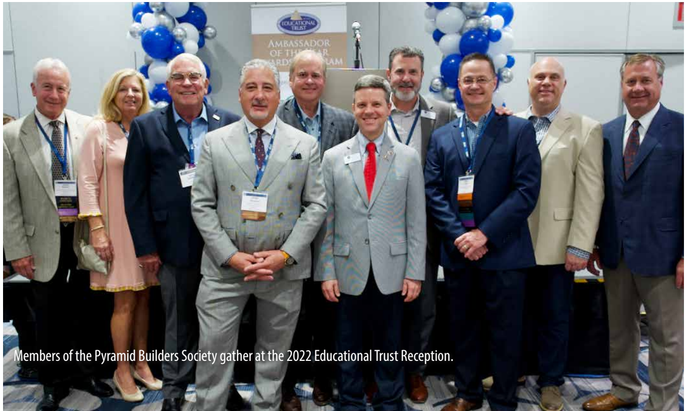
Members of the Pyramid Builders Society gather at the 2022 Educational Trust Reception.

Scan to learn more about the C.A.R.E. Initiative.