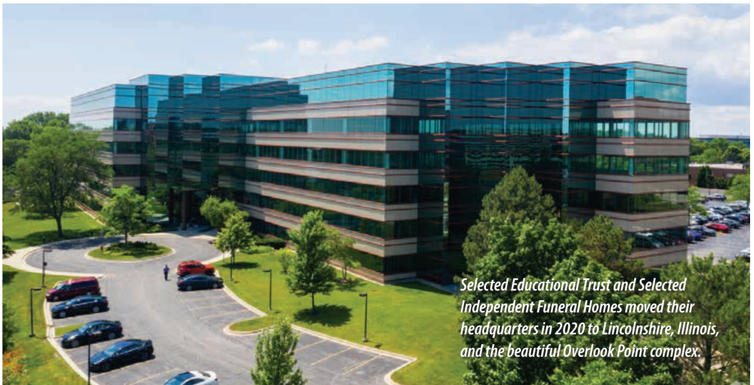
Selected Educational Trust and Selected Independent Funeral Homes moved their headquarters in 2020 to Lincolnshire, Illinois, and the beautiful Overlook Point complex.

But the core of the Trust's purpose would remain the same: to provide the best educational opportunities available to those who work within and for the independent funeral service profession. The Trust will remain the cornerstone of lifelong learning, growth, development and leadership for the future of death-care services.