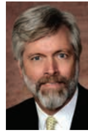
John Wild Iles Funeral Homes/ Dunn's Funeral Home and Crematory Des Moines, IA